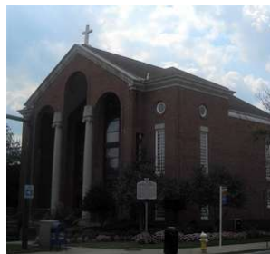
Alfred Street Baptist Church-Renovation